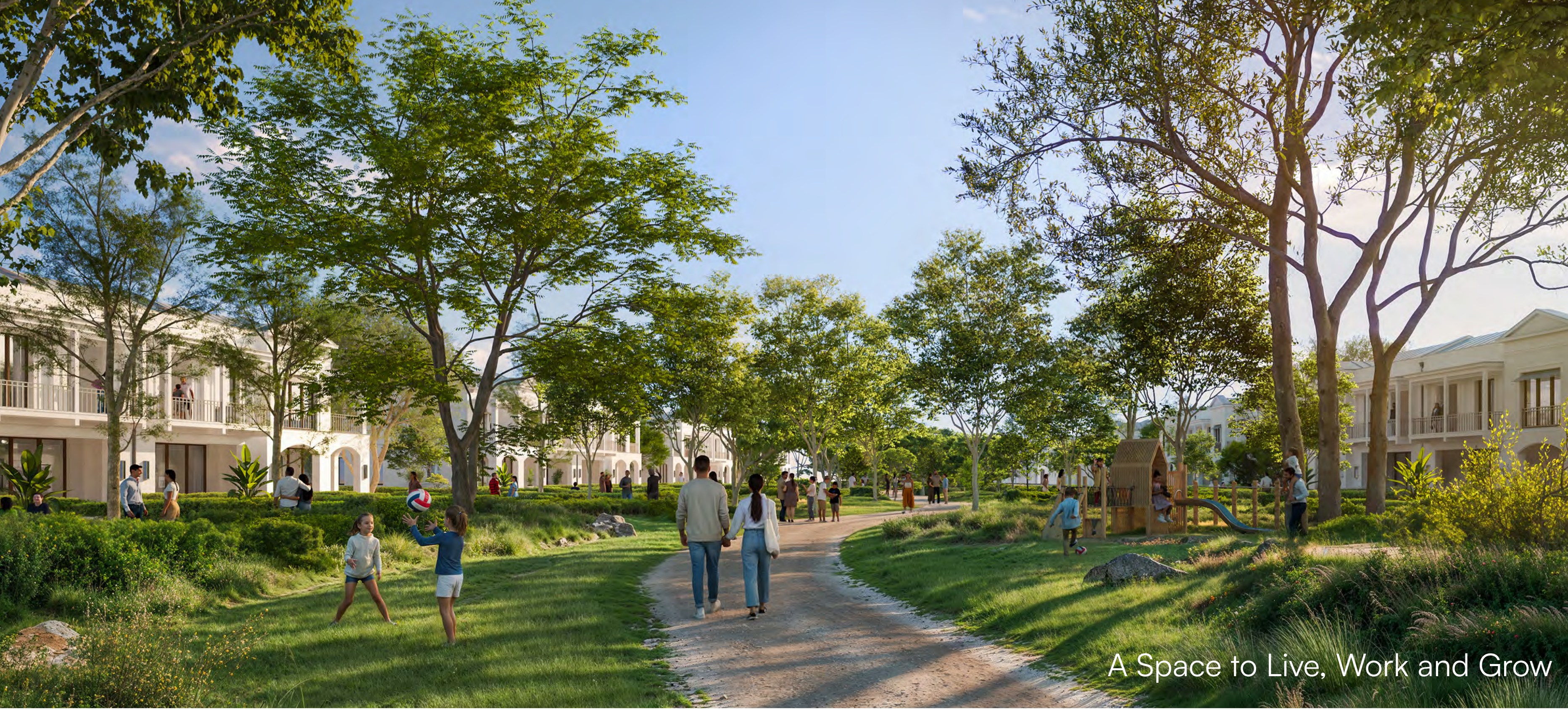
A Space to Live, Work and Grow